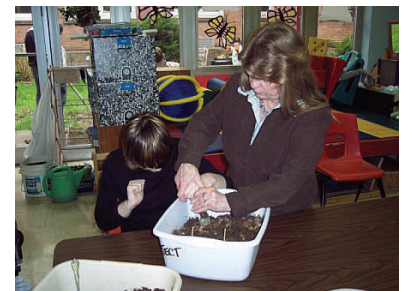
Mrs. Wolfgang's class participated in an Earth Day project.

It has been an enjoyable winter, but we are still looking forward to spring.