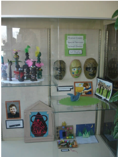
Dumont Building Art Show