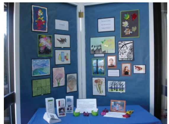
Dumont Building Art Show