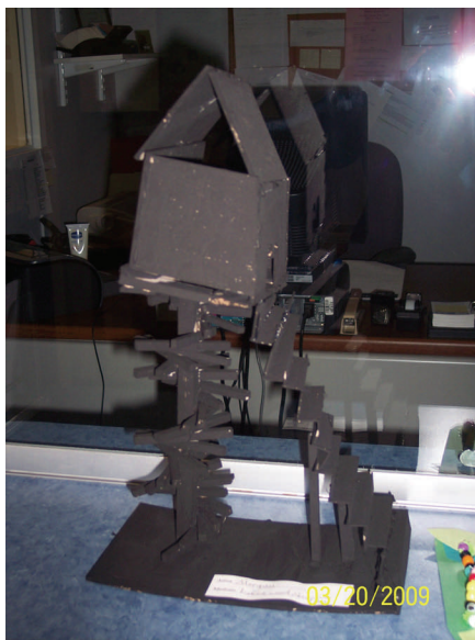
Sample of student art on display

pendence Township Municipal Building in Great Meadows on March 27th. Almost every student in her art classes had a piece of work on display. Students, families, and staff were invited to enjoy refreshments as they perused the art show. It was an exciting night for everyone involved! A small selection of students' work will remain on display through April as part of a larger art show featuring work by students from various schools throughout Warren County.