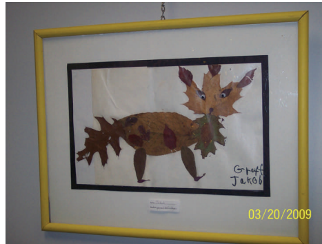
Independence Township Municipal Building

and medically disabled classes and for the behavior classes I especially keep in mind the frustration quotient."